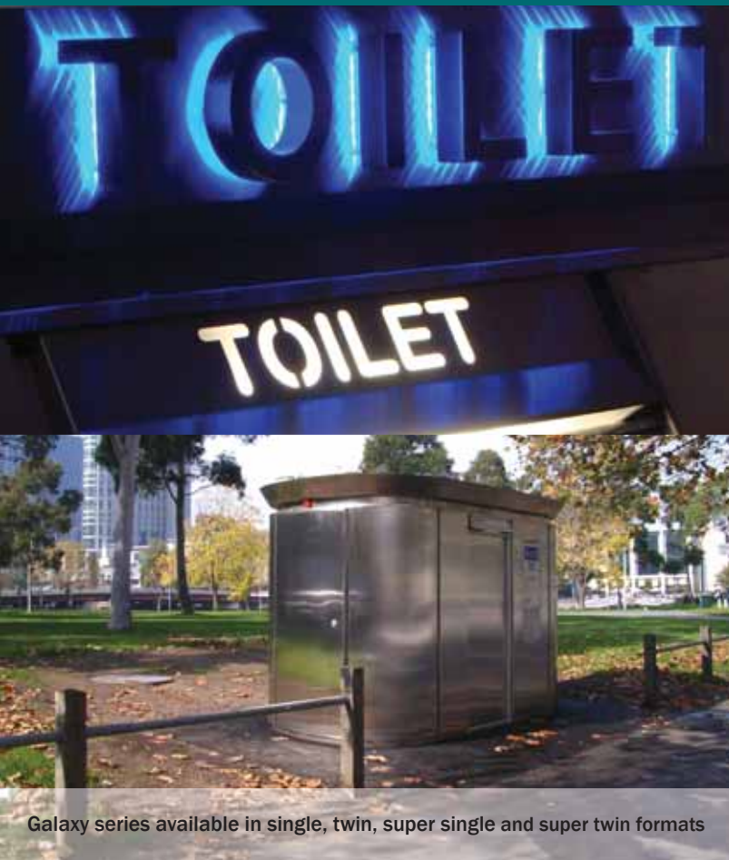
Galaxy series available in single, twin, super single and super twin formats