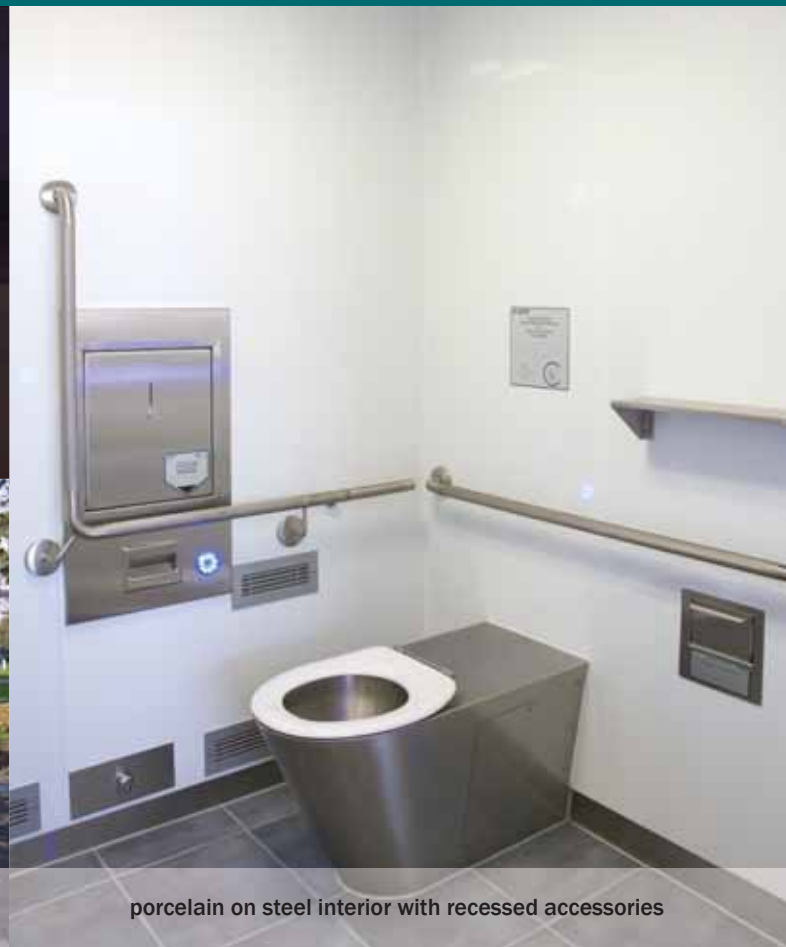
porcelain on steel interior with recessed accessories