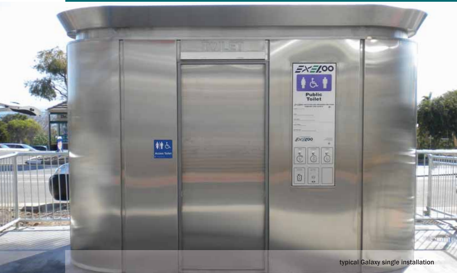
typical Galaxy single installation